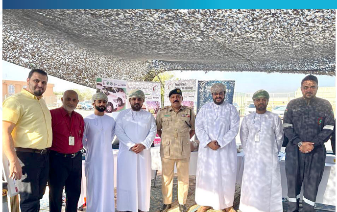
Sunday, March 12, 2023, in collaboration with Safely Cooperation Services Institute (SCS) and Fleet Management Systems & Technologies, Oman Energy Association (OPAL) participated in the Traffic Week Exibition organized by the Engineering Services Department at Ministry of Defense. The event aims to spread awareness of the importance of adhering to traffic rules and regulations among road users to reduce the risk of accidents.